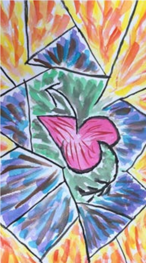
Artwork by Art Play class participant, Untitled , watercolour on paper.