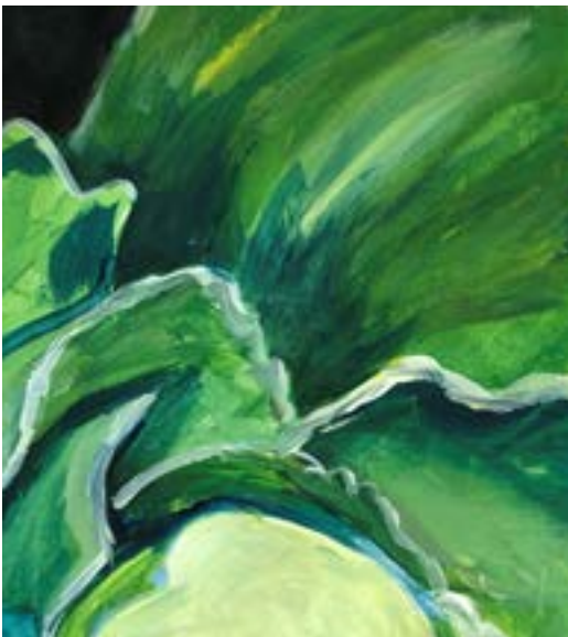
Art Play class participant, Untitled , acrylic on paper.