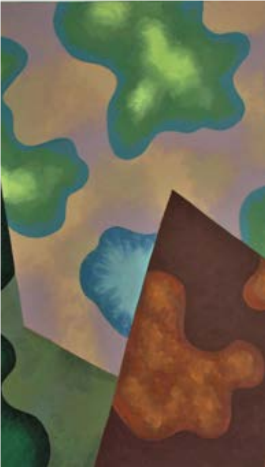
Jeremy Barrett, Untitled , acrylic on canvas.

Exhibition dates: 2 February - 28 March. Opening 6pm Friday 2 February. Free, all welcome.