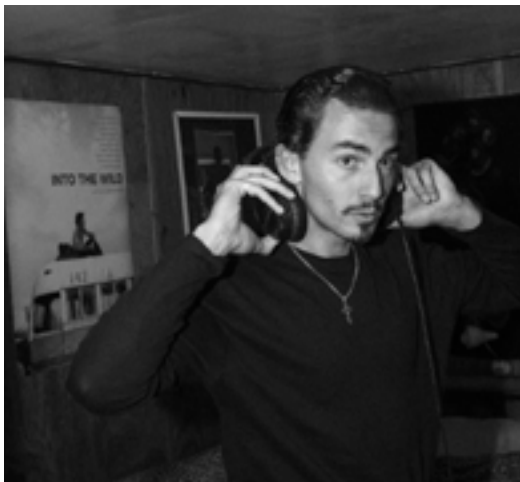
D Kirkland workshop, 2023.