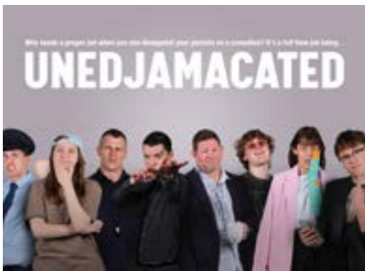
Unedjamacated coming to TAC in March.