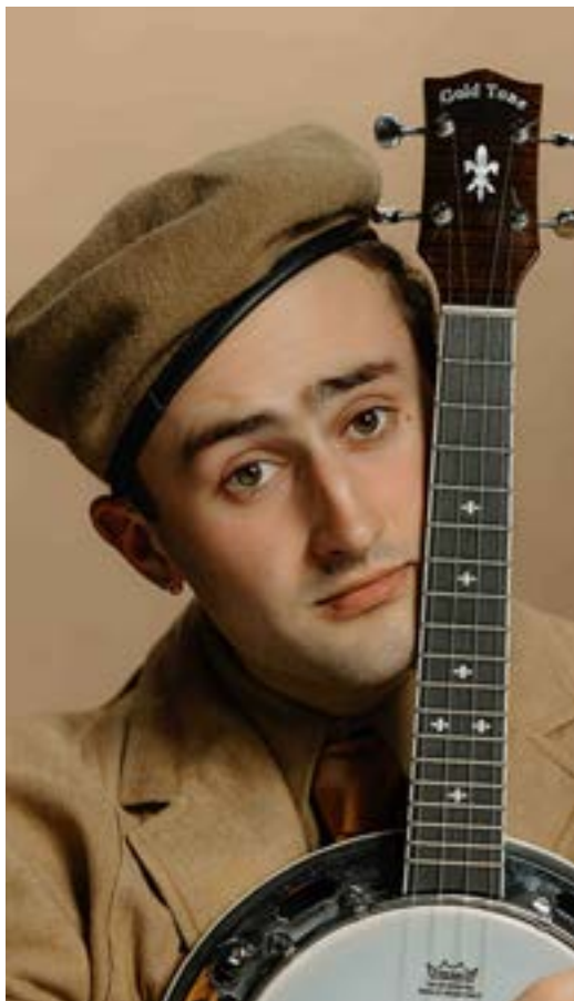
The Ukelele Man by Marcel Cole.