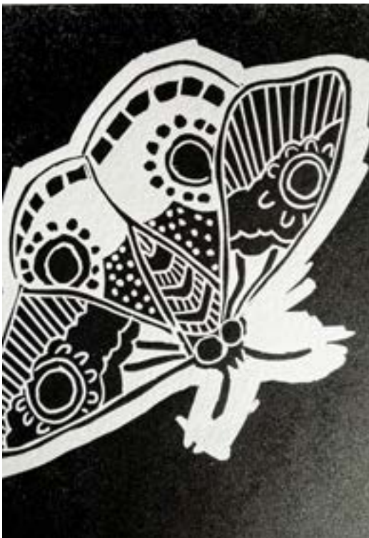
Rechelle Turner, Buugang , lino cut print / work in progress 2023.

Exhibition dates: 14 June – 10 August. Opening 6pm, Friday 14 June. Free, all welcome.