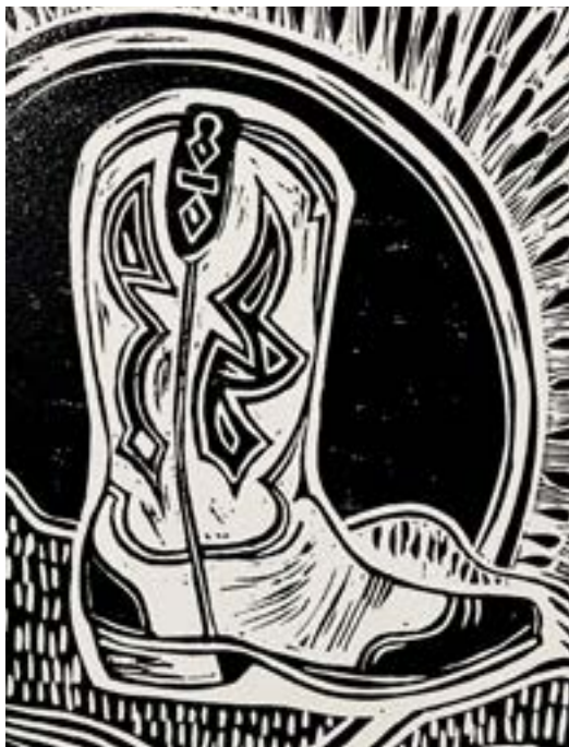
Jamie-lea Trindall, Pathwalker (detail). Lino cut print.

Exhibition dates: 14 June – 10 August. Opening 6pm, Friday 14 June. Free, all welcome.