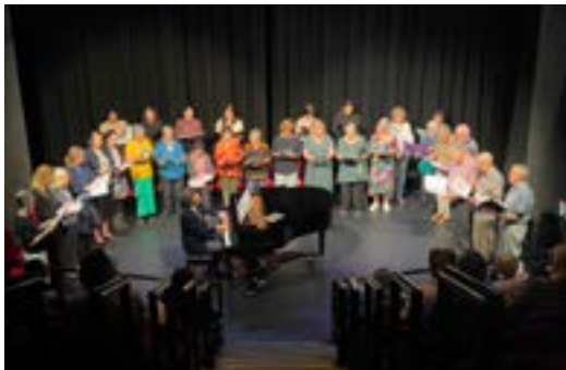
Sing with Toby community choir performing at the TAC25 variety night, November 2023.

*See February for more exhibition details, pp.2 - 4