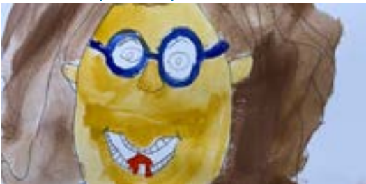
Kids art class participant, Untitled , watercolour on paper.