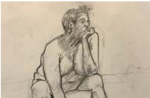
Every Body class participant, Untitled , charcoal on paper.