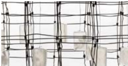
Kati Gorgenyi, Lullabies (detail), 2020.

*Exhibitions continue until 8 June. Details pp.20-22