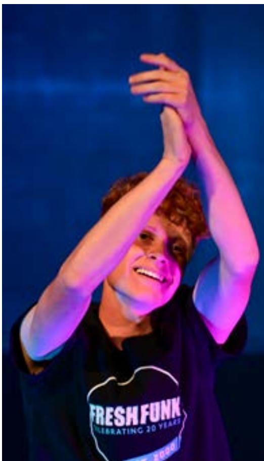
Fresh Faced Young Choreographers Initiative, TAC Theatre 2023.