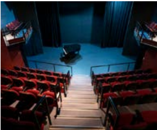
TAC Theatre, 2023.