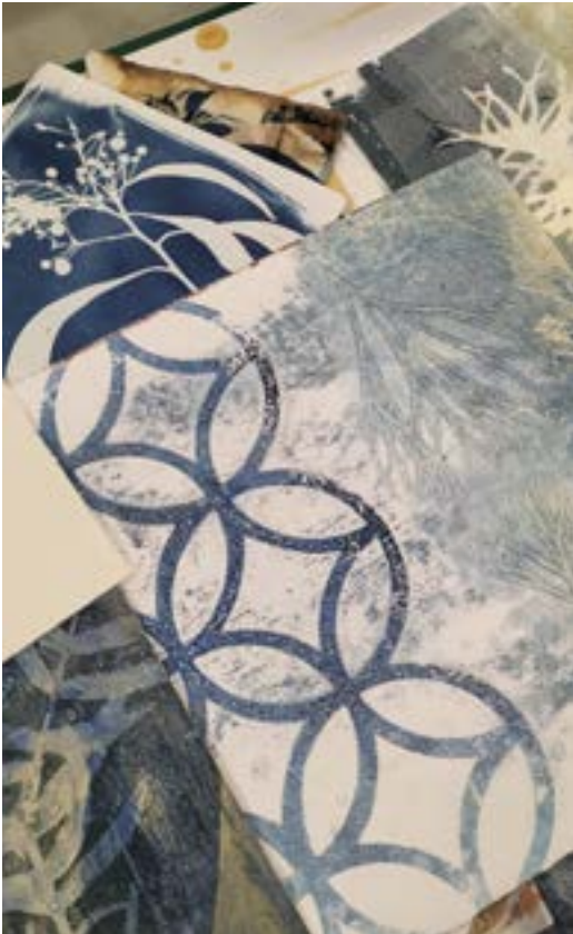
Jo Hollier, Untitled , collection of gelli printed papers.