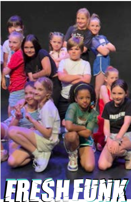
Mini Funk dancers posing after their end-of-term performance in the TAC Theatre, December 2023.

Fresh Funk has paved the way for young dancers to learn, explore and create hip-hop and contemporary dance styles for over two decades. The program offers fun-filled classes, large-scale shows, competitive crews, overseas tours, choreographic development opportunities and workshops with guest choreographers. Fresh Funk prides itself on a culture of acceptance, inclusion, and the importance of community. Classes run during school terms and class allocation is determined by the Program Director on enrolment.