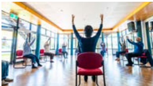
ZEST Dance for Wellbeing class at Tuggeranong Arts Centre.