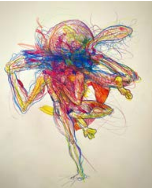
Robbie Karmel, Tulpa Drawing 1 , 2023.

Exhibition dates: 5 April – 8 June Opening 6pm Friday 5 April Free, all welcome.