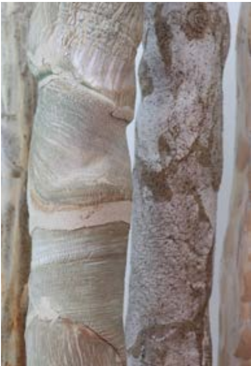
Josephine Townsend, Forest of Trees , ceramics, 2022.

Exhibition dates: 2 February - 28 March. Opening 6pm Friday 2 February. Free, all welcome.