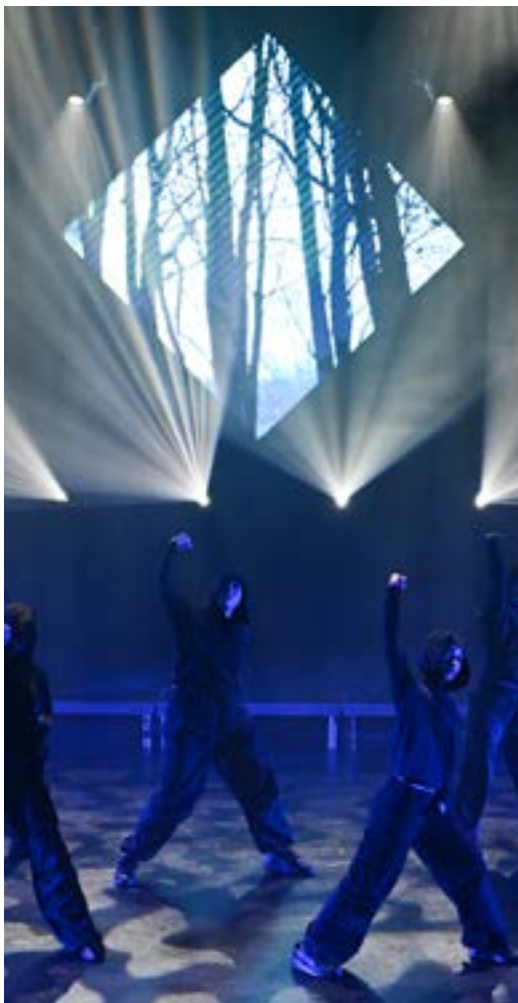
Fresh Funk performing in Addams, at the Erindale Theatre 2023.