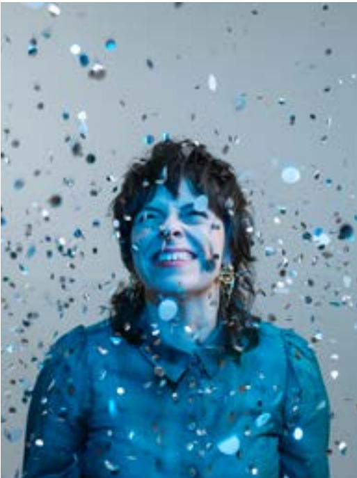
I Want it that Gay